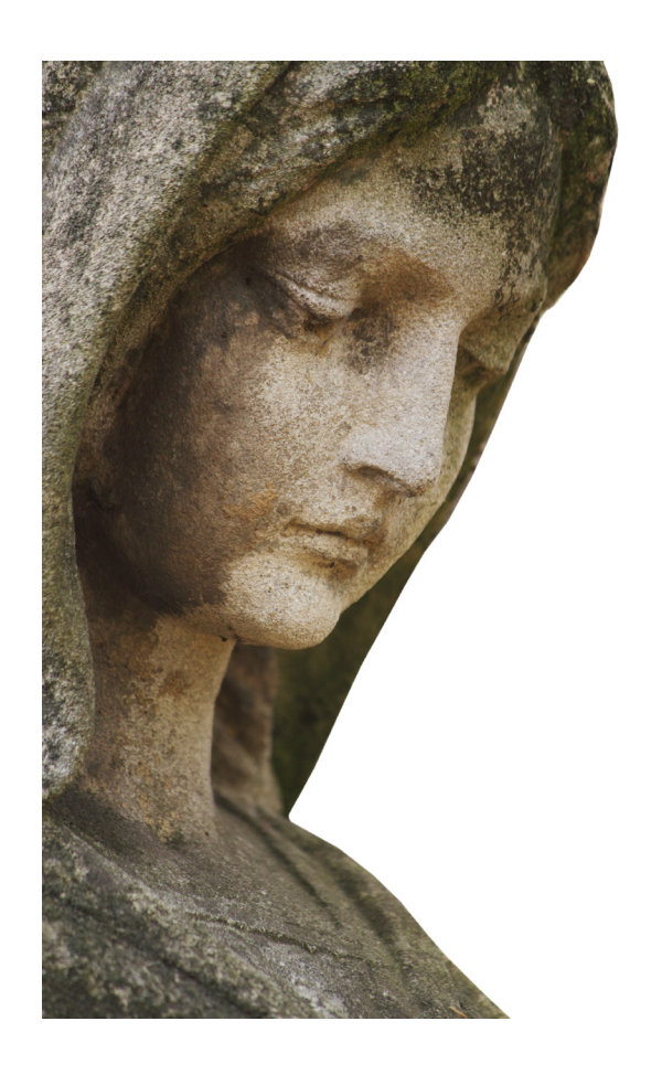
Alexandría Brighton Collection of Essential Oils